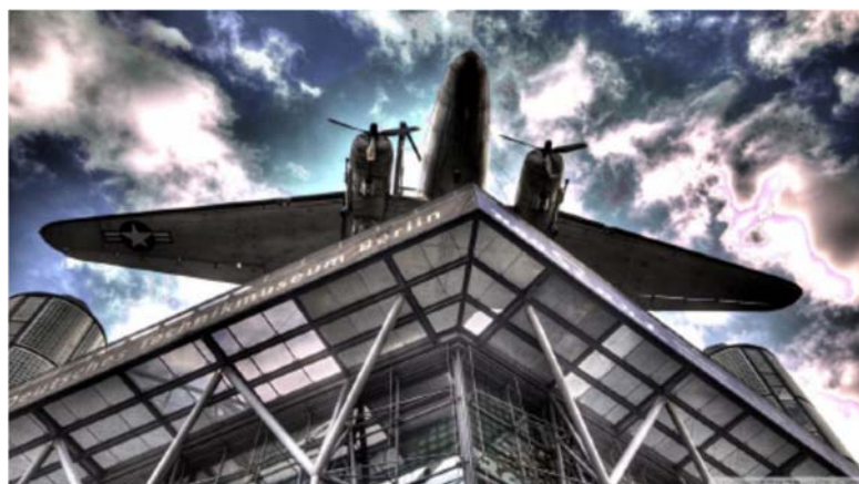
Deutsches Technikmuseum Berlin

The students were happy with the trip and benefitted from both the university visit and visits to actual companies, where they experienced production lines and problem solving from a company perspective.