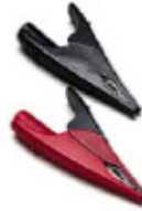
AC285-FL: Alligator Clips.