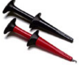
AC280-FL: Hook Clips.