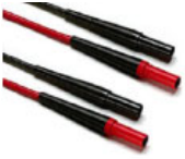
196-3523-00: Extender Leads (1.5 m).